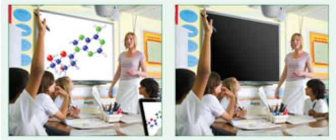
Eco AV mute off 100% power consumption

Stay in control of your presentation with the Eco AV mute feature. Direct your audience's attention away from the screen by blanking the image when no longer needed. This also instantly reduces the power consumption to 30%, further prolonging the life of your lamp