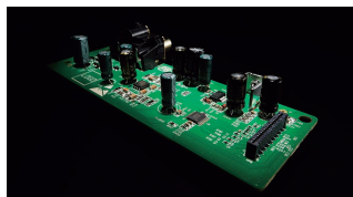
Audio DAC Circuit Board

The BDP-X300 is elaborately designed to reproduce high-quality sound, including the dedicated 192 kHz/24-bit audio DAC circuit board, shielded case for the power supply (SMPS), and gold-plated HDMI and audio terminals. The embossing on the shield case and the special inner form of the Anti-Standing Wave Insulator also help to suppress standing waves.