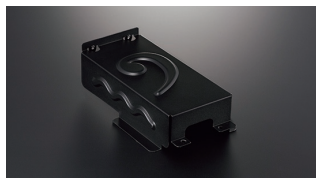
SMPS Shield Case