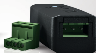
SUSHI-RB DMX output using connector Block