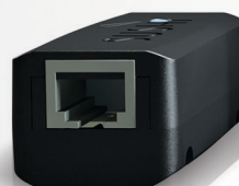
SUSHI-RJ DMX output using RJ45 connector