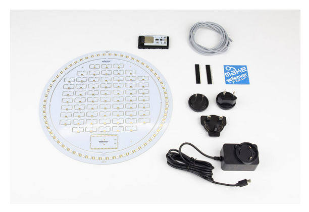
What's in the box (white edition)