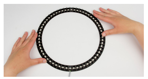
Backside of assembled clock (black edition)