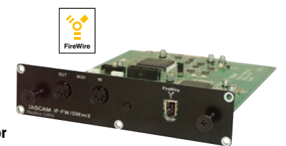
IF-FW/DM MKII FireWire card for 32-channel interconnection with DAWs